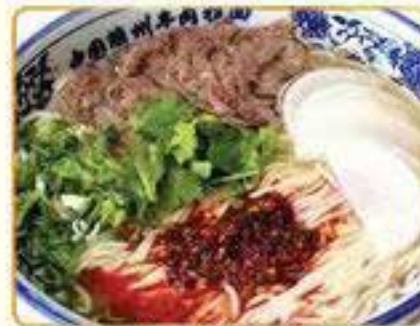
Spicy Beef Noodles