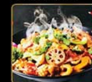
Mizu Stir Spicy Pot