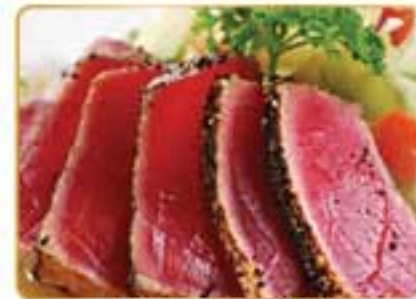
Pepper Tuna Tataki