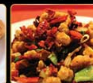
Spicy & Aromatic Chicken