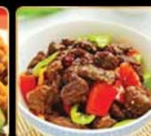
Beef w. Cumin