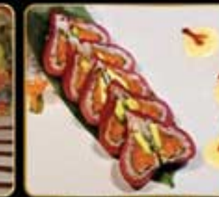
Sweet Heart Roll