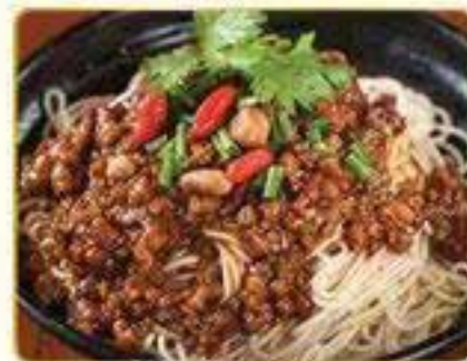
Zha Jiang Mian