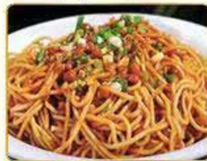
Hot & Dry Noodles